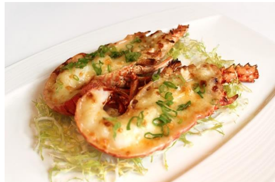
Baked Lobster with Cheese