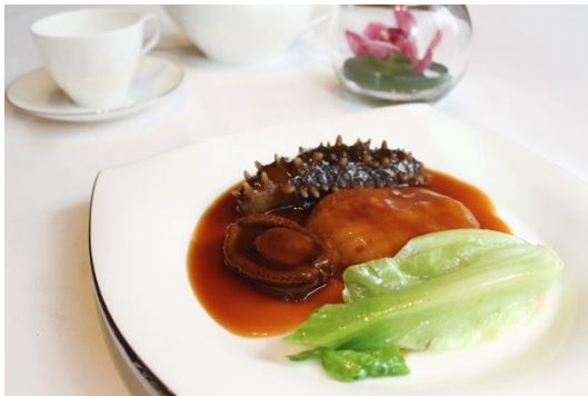
Braised Whole Five-Head South African Abalone, Sea Cucumber and Pomelo Peel with Supreme Oyster Sauce