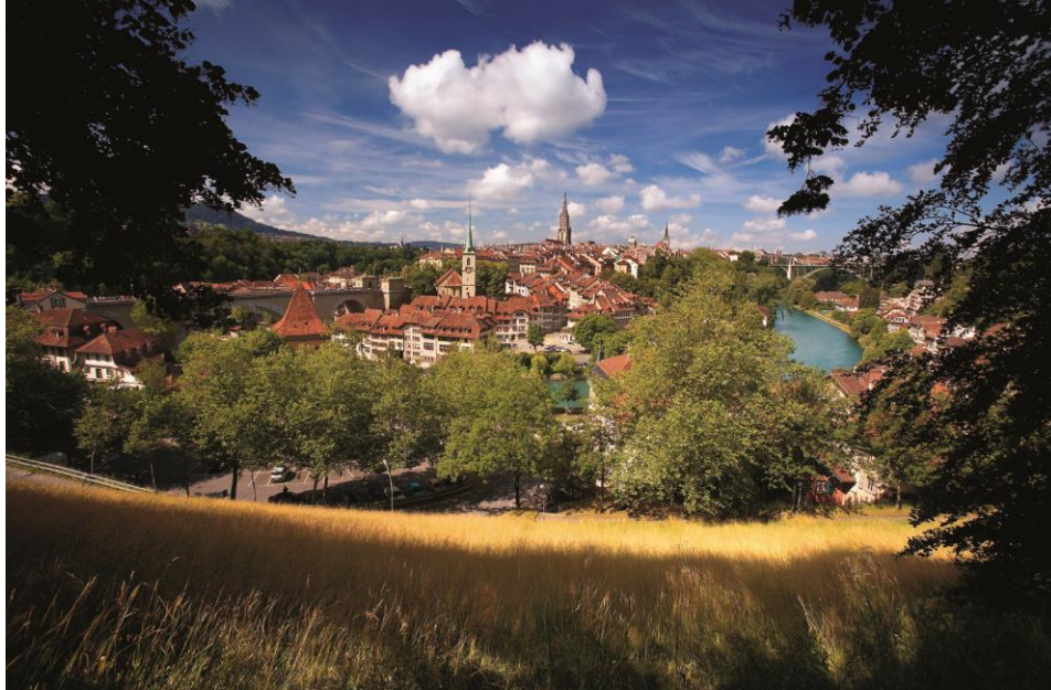
Bern - Old Town

In the vibrant Olympic city of Lausanne, guests of the Royal Savoy are able to enjoy experiences including a tour of the panoramic Lavaux wine region and a boat cruise on Lake Geneva, a yoga class in the hotel garden or a visit to the Charlie Chaplin Museum. In Bern, the hidden gem of European capitals, guests of the Schweizerhof Bern have a wide choice of activities from visiting the UNESCO World Heritage Old Town, the Albert Einstein museum and the Zentrum Paul Klee to sampling a delicious cocktail on the hotel's Sky Terrace. At the Bürgenstock Resort, the ultimate luxury mountain escape high above Lake Lucerne, guests can choose from an excursion to Mount Pilatus, relaxing at the world-famous Alpine Spa or enjoying authentic Asian cuisines at Spices Kitchen & Terrace.