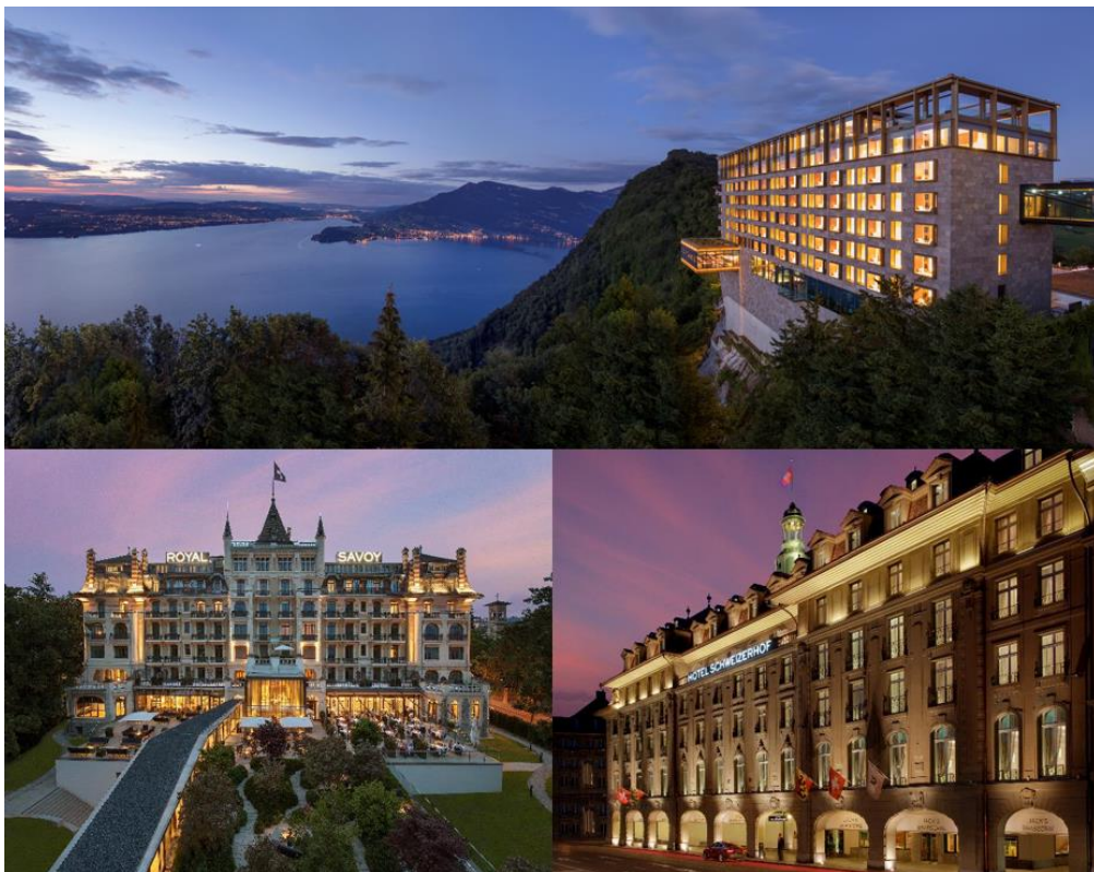
The Bürgenstock Resort Lake Lucerne (Top), the Royal Savoy Hotel (Left) The Hotel Schweizerhof Bern & THE SPA (Right)

The Bürgenstock Selection, Switzerland's largest deluxe hotel group, launches 'Swiss Escape' to take guests on a journey across Bern, Lausanne and Lucerne. The signature offer allows guests to appreciate the luxury of two Leading Hotels of the World properties and one Preferred Hotel.