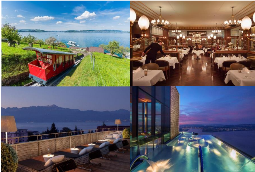
The Bürgenstock Selection