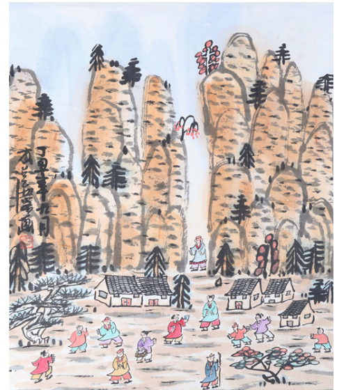
"A Happy Life" by Fang Zhaoling, Macey & Sons, Hong Kong, Room 4226

Fang Zhaoling was a recognised as one of China's foremost artists, in addition to being the mother of Hong Kong politician Anson Chan. Her work is known for its rich substance and palette, with elegant yet simple figures and majestic landscapes. The artist combines calligraphic lines and forms to illustrate mountains instead of using the traditional "cun" method of stroke shading.