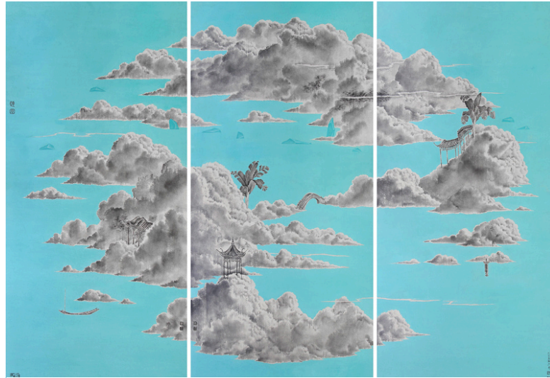
"Tranquil Lake" by Ding Wenqing, Suomei M50 Art Gallery, China, Room 4221

Intersections: China , will highlight the diversity and dynamism of Chinese contemporary art and feature works that challenge norms and break artistic rules. A wide range of works comprising original paintings, editions, photography, and sculpture will be on exhibit.