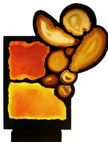
"Hope of Light VII" by Christophe Dénoux, CWC Consulting & Art, Hong Kong, Room 4116

The Hope of Light series by Christophe Dénoux (b 1960) is made using the traditional French "Dalle de Verre" slab glass technique. Slabs of Agate and artisanal glass, produced by a family with a four-generation history in glass making, are bonded together creating unique contemporary artworks. Dénoux hopes each of us can feel an emotion of pure beauty in the light passing through each piece.