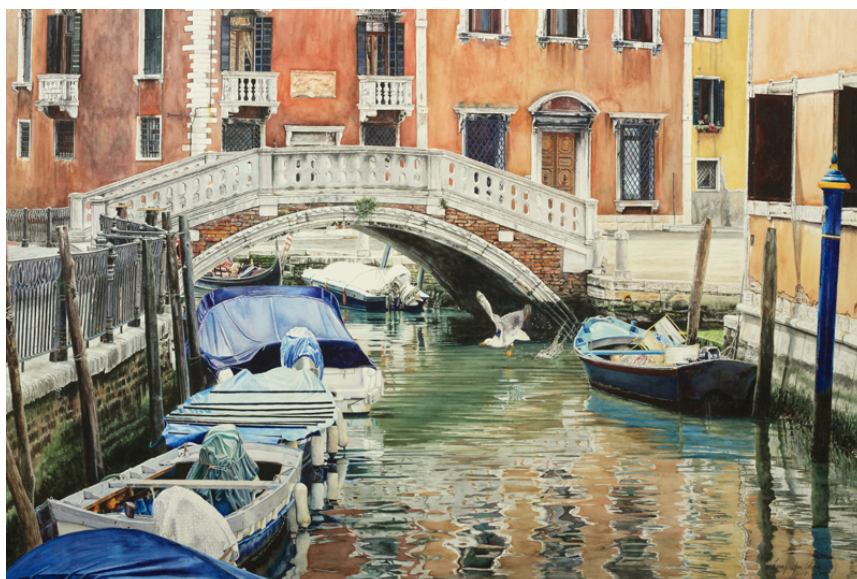
"Water Dance" by Leung Yun Charm, Hong Kong, Room 4125