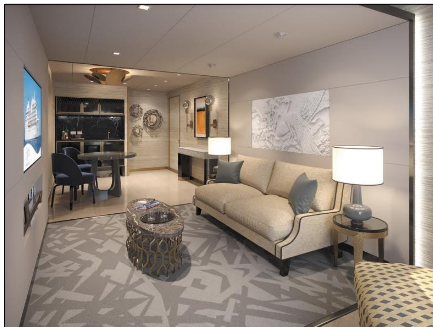
Seven Seas Suite

Seven Seas Suite. This sanctuary offers more than 800 square-feet of exquisite space, and exudes a cosmopolitan apartment feel with a soothing color palette complimented by plush furnishings. The suite flows effortlessly from living room to dining area to bedroom, with sliding glass doorways leading to a spacious private balcony. A magnificent marble bathroom sits adjacent to the oversized bedroom and large walk-in closet.