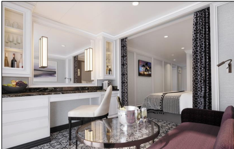
Deluxe Veranda Suite

Deluxe Veranda and Veranda Suites. The two-category Deluxe Veranda and Veranda suites on Seven Seas Splendor are up to 361 and 307 square feet respectively, placing them among the most spacious entry-level suites at sea. They feature a warm island manor feel and boast curtains that separate the bedroom, with vanity and sitting area outfitted with a plush sofa, a coffee table large enough for in-suite dining, and a large desk space.