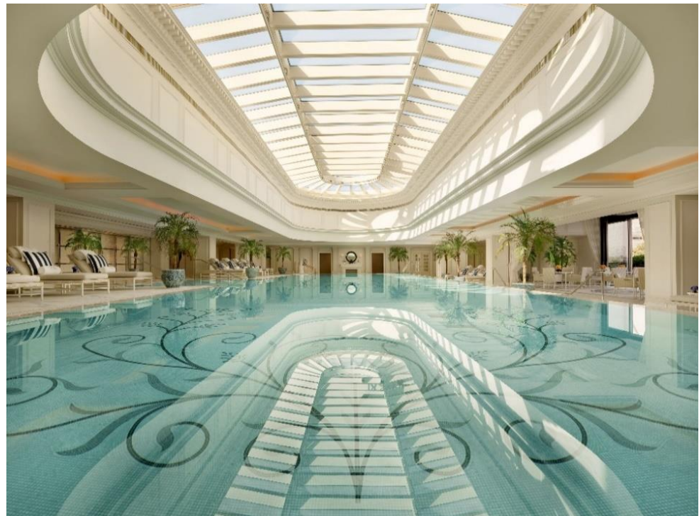
The Peninsula Shanghai’s indoor pool is awash in natural light that showcases an elegant tile mosaic pattern.