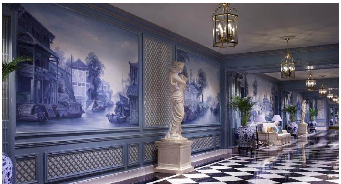
Every space at The Ritz-Carlton Tianjin is intricately detailed; corridors feature hand painted murals created by local craftsmen.