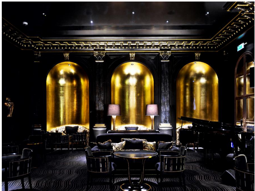
High drama at The Savoy's Beaufort Bar blends Art Deco patterns and colors with an English Edwardian backdrop, renovated from the hotel's original cabaret stage of the 1920's and 30's.