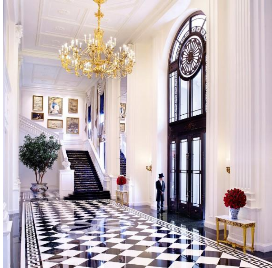
The Ritz-Carlton Tianjin's lobby is a study in English Neoclassical symmetry and balance with Corinthian columns and a grand staircase flanking the entry.