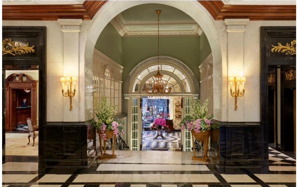
A view from the lobby of The Savoy with a glimpse into the heart of the hotel, inviting guests in to explore its chocolate shop, tearoom, restaurants and bars.