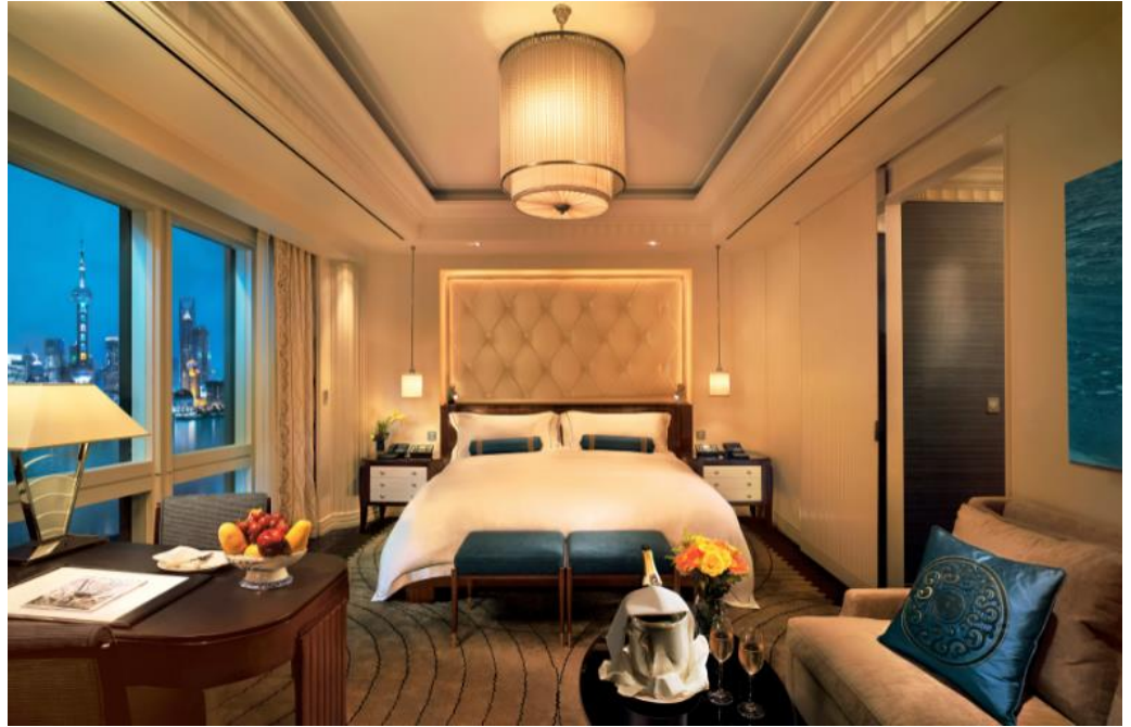
Deluxe River Rooms at The Peninsula Shanghai overlook the Huangpu River and dynamic Pudong skyline. Elegant European detailing blended with Chinese patterns are a nod to when Shanghai was regarded as the “Paris of the East.”