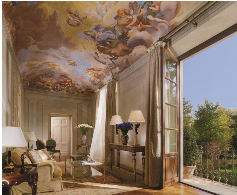
A Presidential Suite at the Four Seasons Florence, where no two rooms are the same. Each is inspired by the color palettes of restored frescoes, original artwork, and lush garden surroundings.